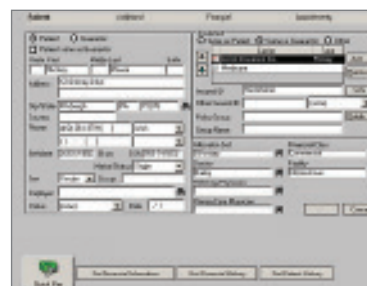
QuickPay patient screen

Convenient & accommodating QuickPay provides an easy-to-use screen for adding a patient payment at the time of service, allowing front staff to enter payments without accessing Centricity Billing. ◆