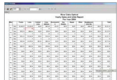
Yearly Sales and Units Report